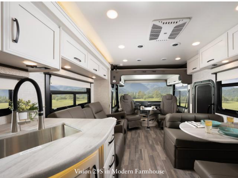
Vision 29S in Modern Farmhouse