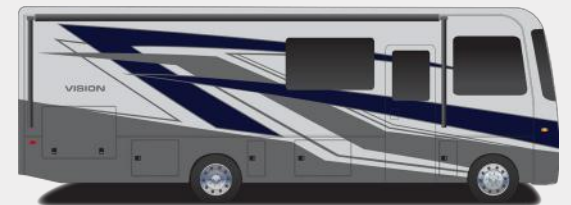
Horizon Full-Body Paint