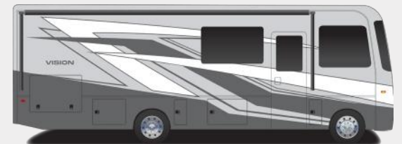
Mirage Full-Body Paint