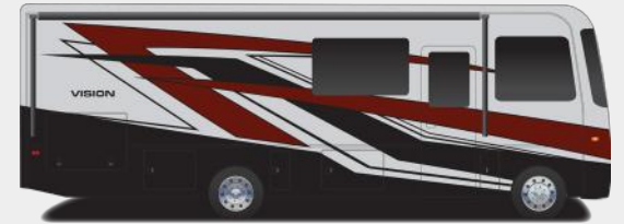
Echo Full-Body Paint