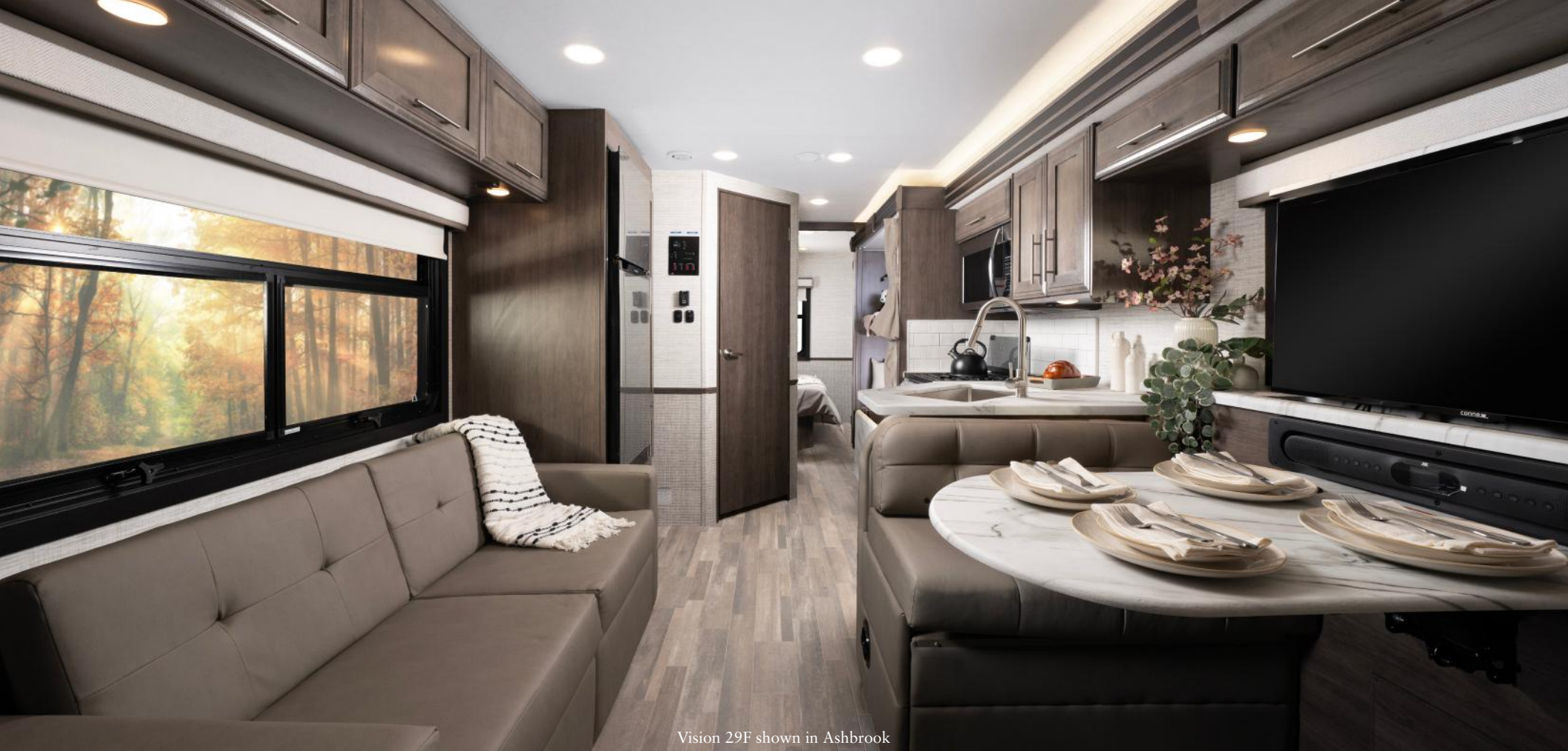
Vision 29F shown in Ashbrook